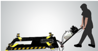
New design portable lift