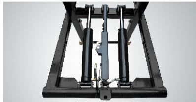
New Safety Lock: High strength safety ladder, mechanical self - locking design, manual safety release.