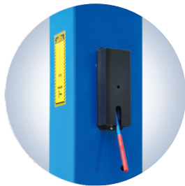
Single-Point Safety Release

Peak is proud to introduce a revolutionary designed manual single-point safety release system for their base plate lifts. The super single-point manual release allows the operator to unlock both column locks from one column. Many manufacturers incorporate electro-mechanical lock release systems that are complicated and unreliable.